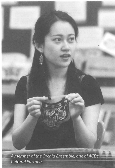
A member of the Orchid Ensemble, one of ACE's Cultural Partners.

Decorate tube exterior with pencils, markers, puffy paint, or other medium