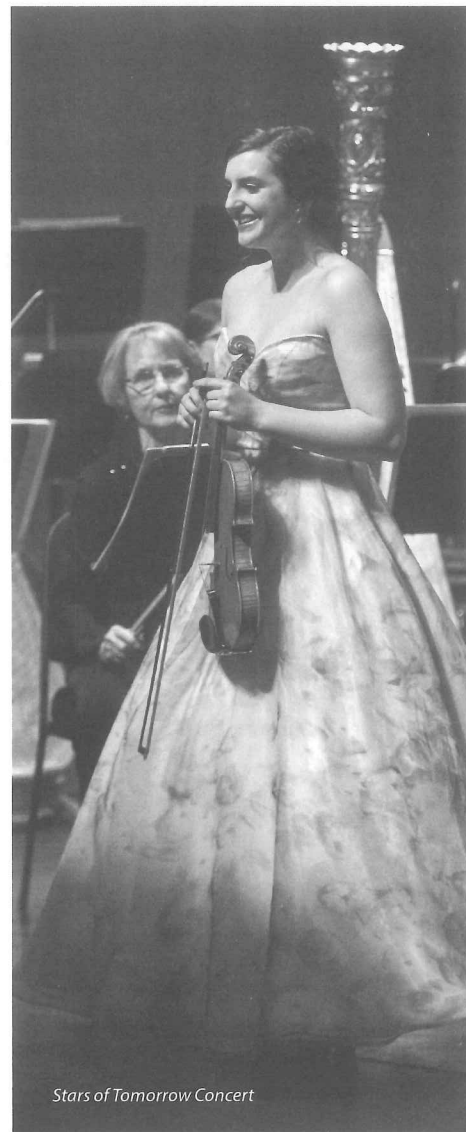
Stars of Tomorrow Concert